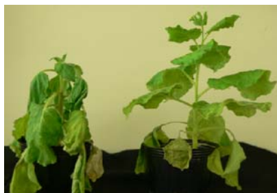
Fig. 2. Bacterial wilt on tobacco plant caused by Ralstonia solanacearum (left) and genetic engineered bacterial wilt-resistant tobacco plant (right)