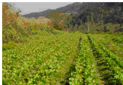
Fig. 4. Development of technology for organic cultivation