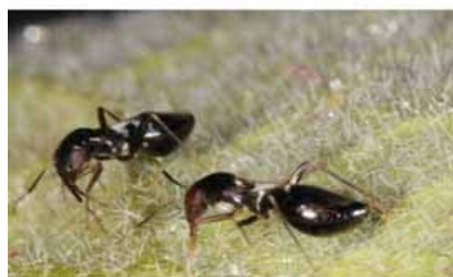
Fig. 3. A natural enemy insect, Pilophorus typicus , native to Kochi prefecture